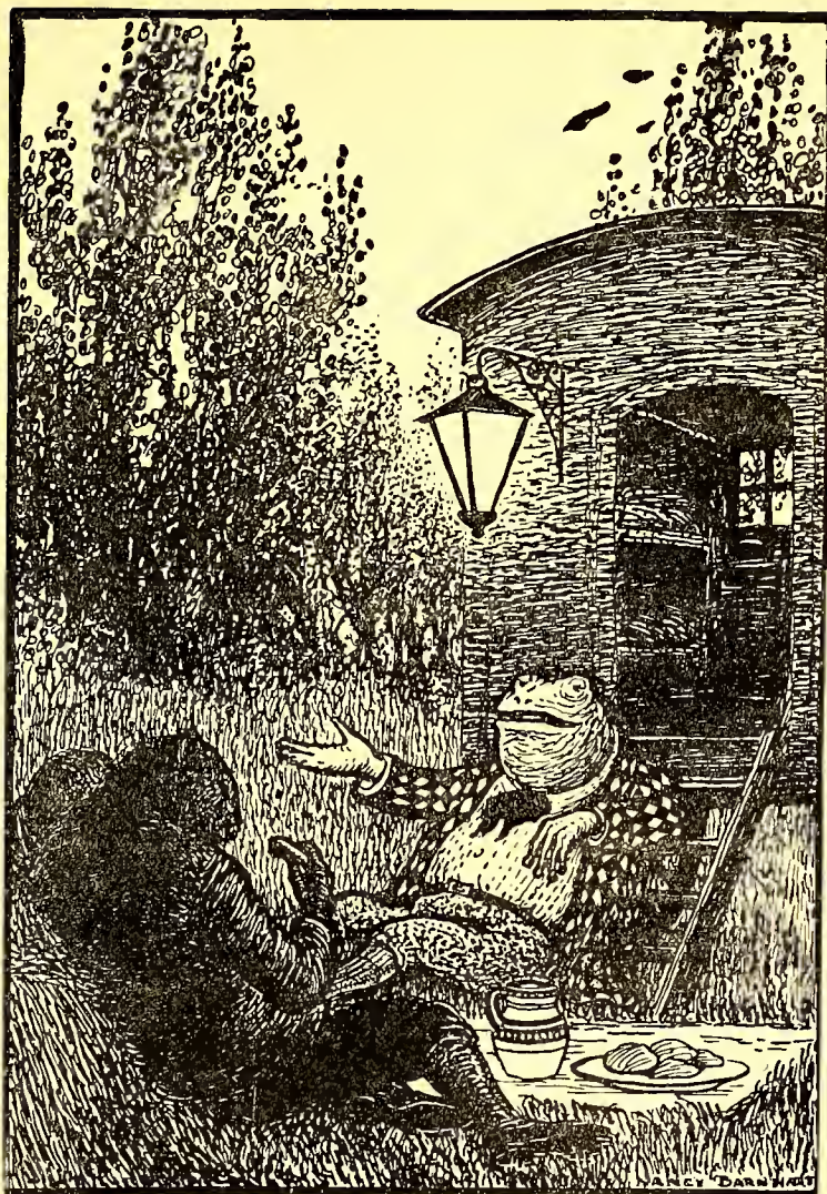
TIRED AND HAPPY AND MILES FROM HOME